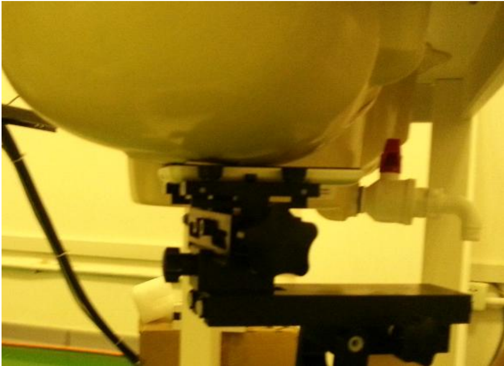
Right Head Touch Cheek Position