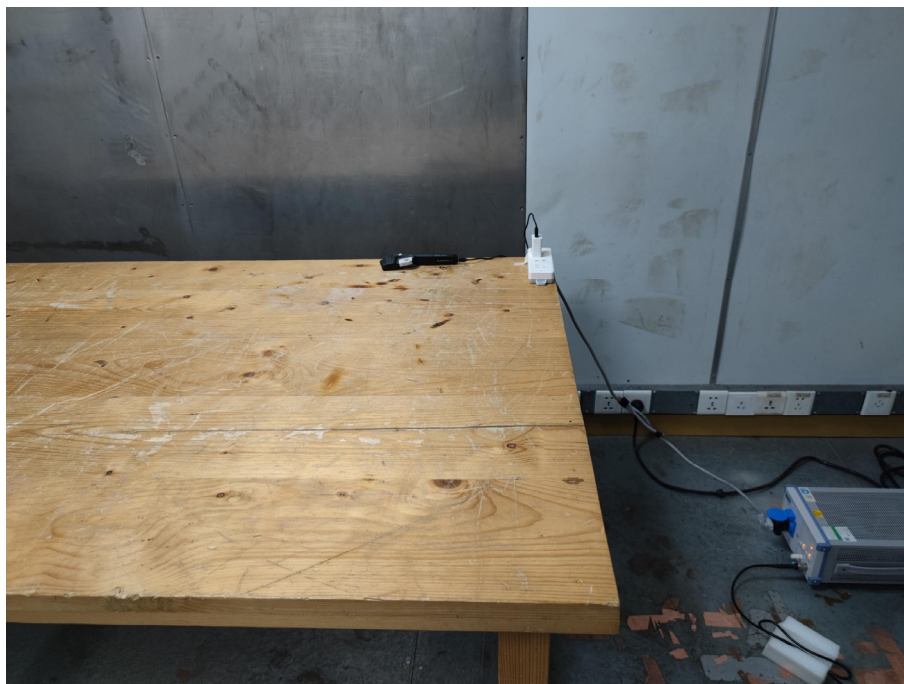
Photo of Conducted Emission Measurement