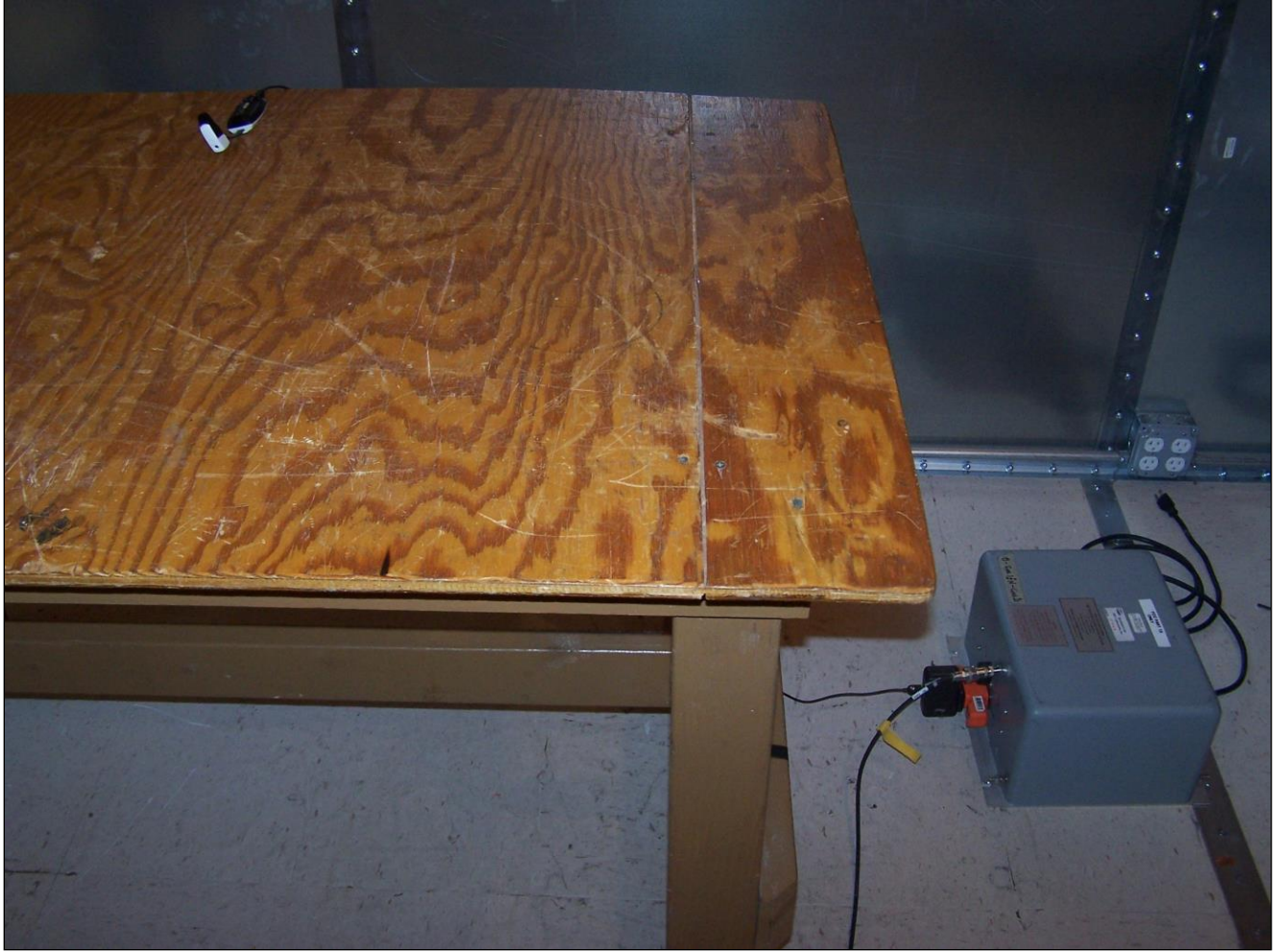
Conducted Emissions, 15.207(a), Test Setup