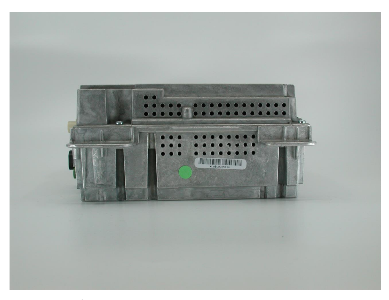
3. Right Side of MFA2 Housing