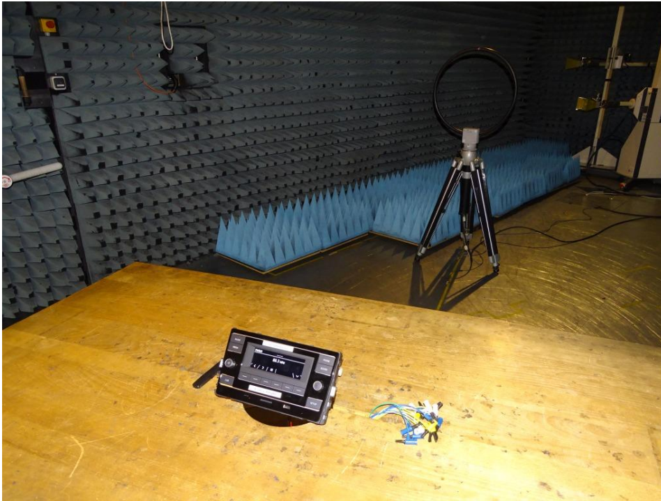
Photo 1: Test setup for radiated measurements (Enclosure, below 30 MHz, intentional radiator §15, ANSI C63.10)