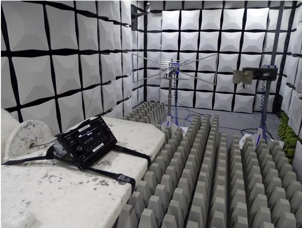
Photo 3: Test setup for radiated measurements (Enclosure, fully-anechoic chamber, 1-25 GHz intentional radiator §15, ANSI C63.10)