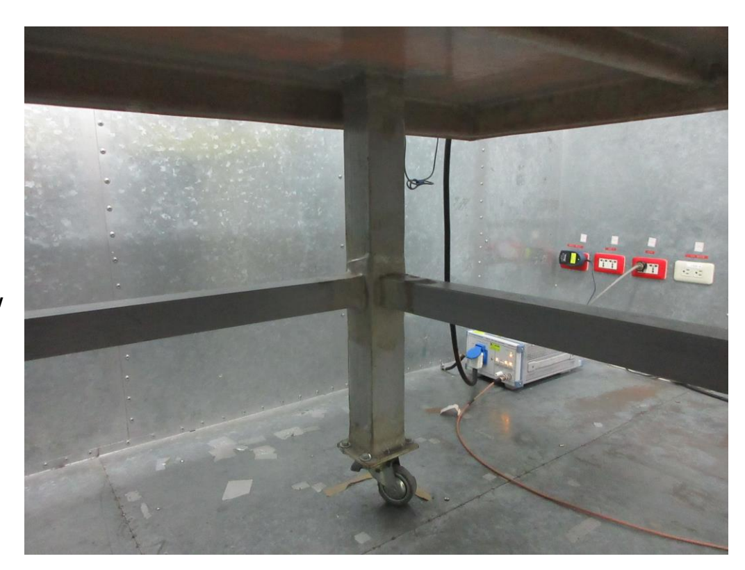
Under table view