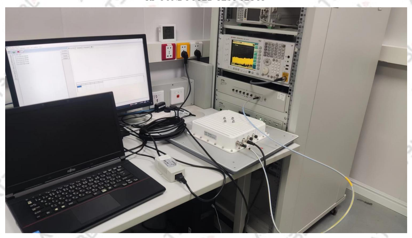
RADIATION EMMISSION BELOW 1GHZ