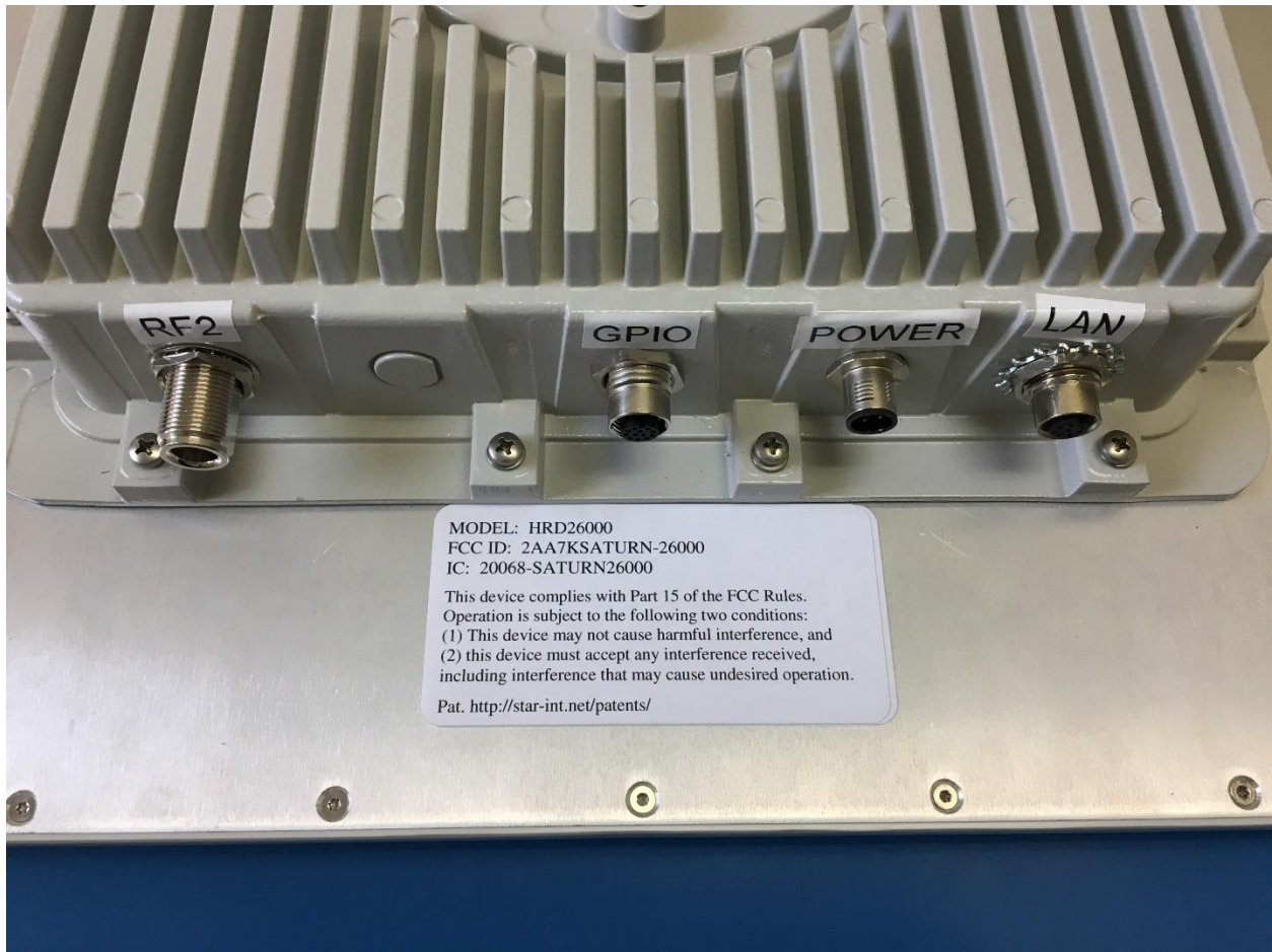
Figure 3: Close-up of Label Placement