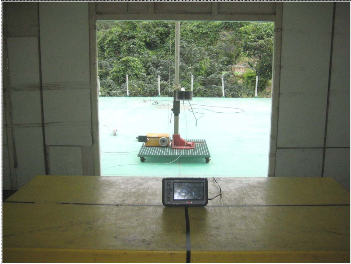
Front View (Frequency above 1GHz)