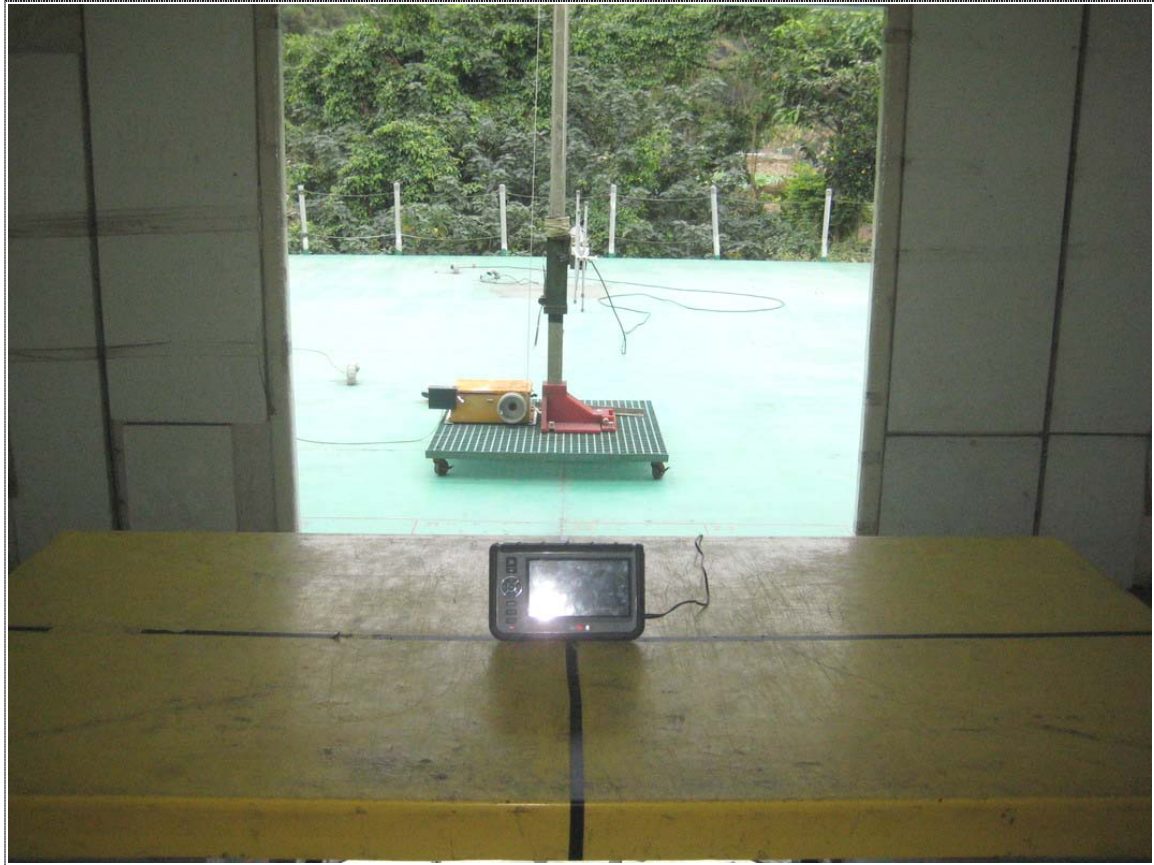
Front View (Frequency below 1GHz)