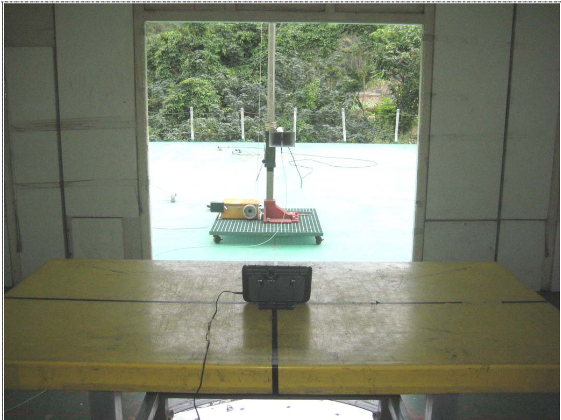
Rear View (Frequency above 1GHz)