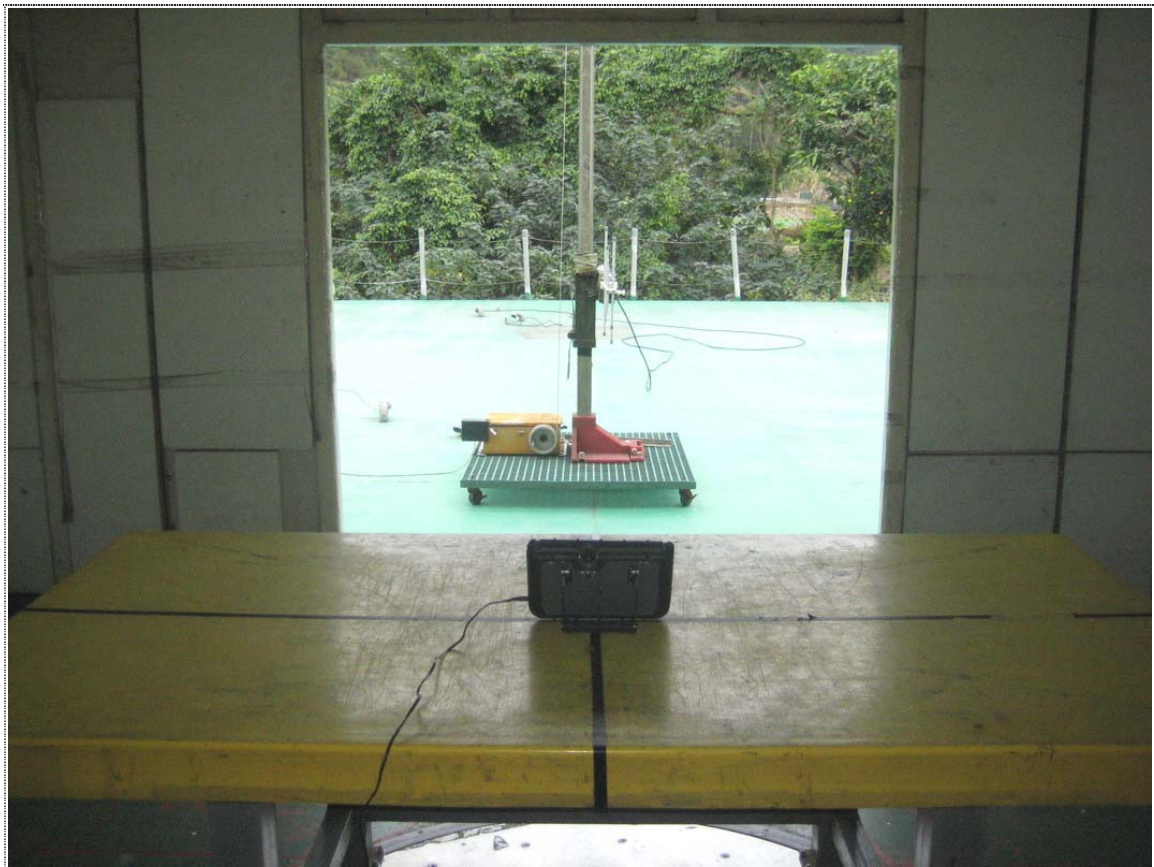
Rear View (Frequency below 1GHz)