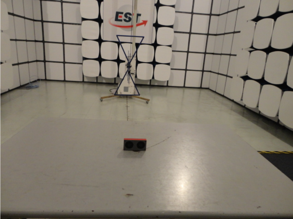
Radiated Test (1000-25000 MHz)