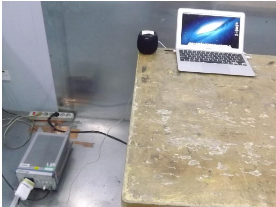
Photograph – Radiation Spurious Emission Test Setup