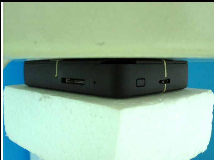
Front Face of EUT with 0 cm Gap