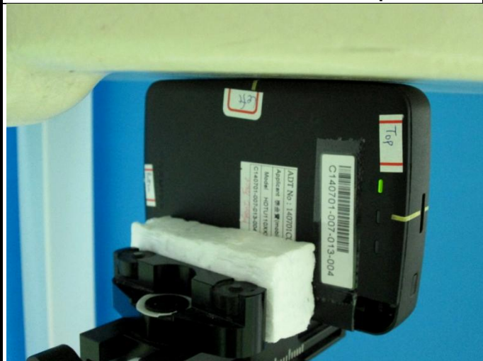
Left Side of EUT with 0 cm Gap