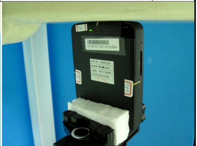
Top Side of EUT with 0 cm Gap