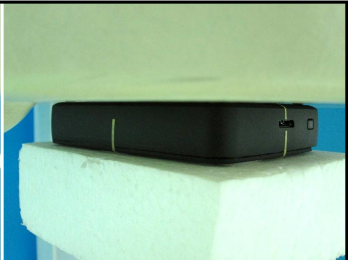
Rear Face of EUT with 0 cm Gap