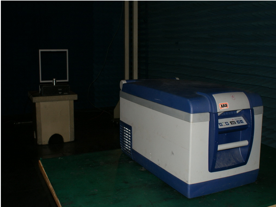
Photograph 2: Set-up for Spurious Emissions (30MHz-1GHz)