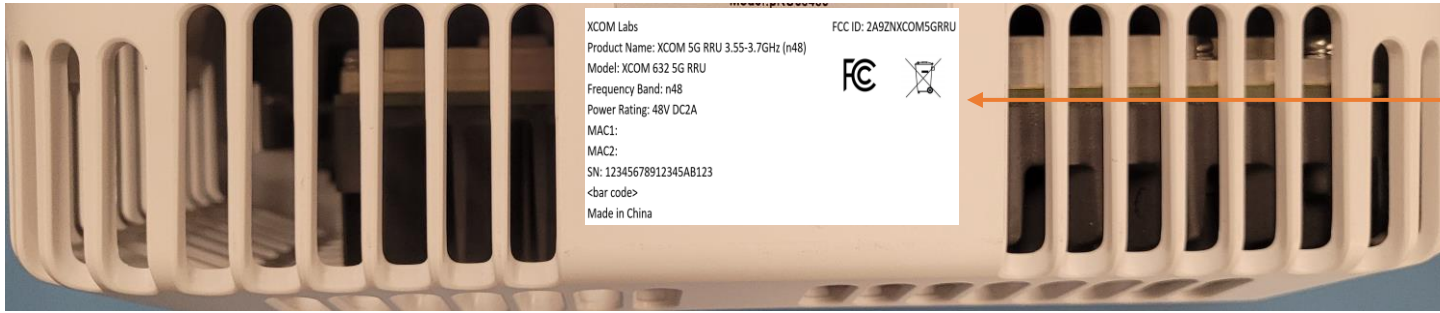
XCOM 632 5G RRU FCC Label Location