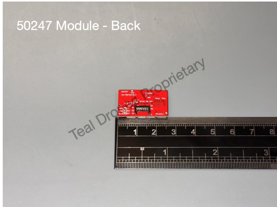
Photograph 3: Back View of DUT PCB