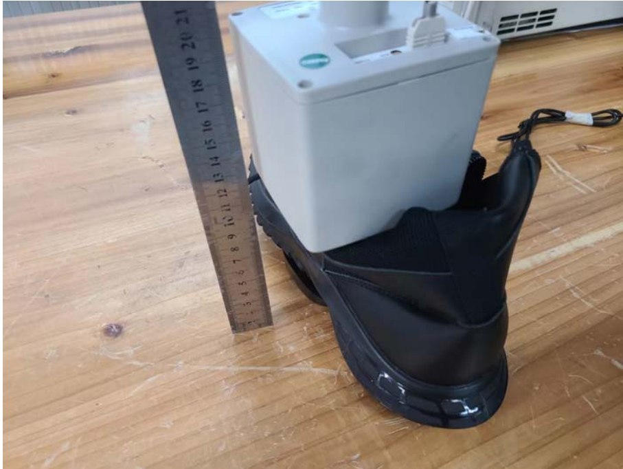
Test Position E-15cm from the edge of EUT to the geometric center of the probe