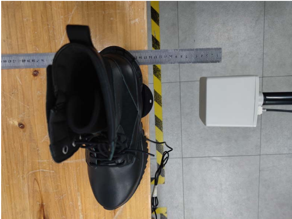
Test Position C-15cm from the edge of EUT to the geometric center of the probe