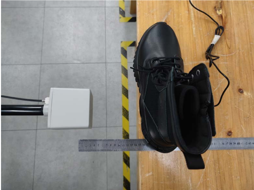
Test Position B-15cm from the edge of EUT to the geometric center of the probe