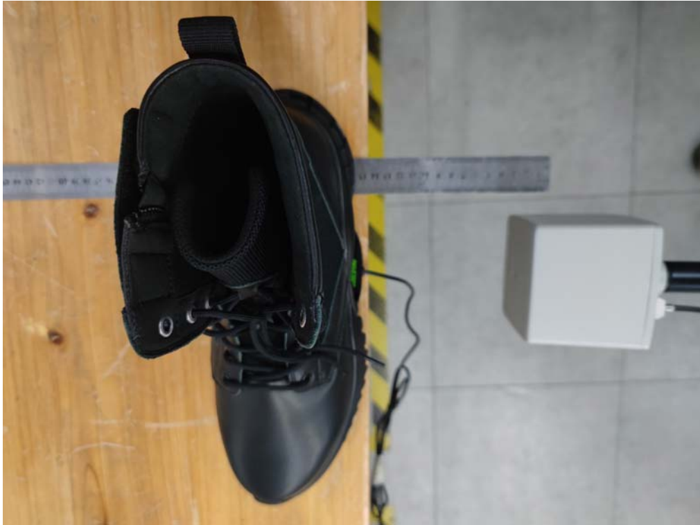
Test Position A-15cm from the edge of EUT to the geometric center of the probe