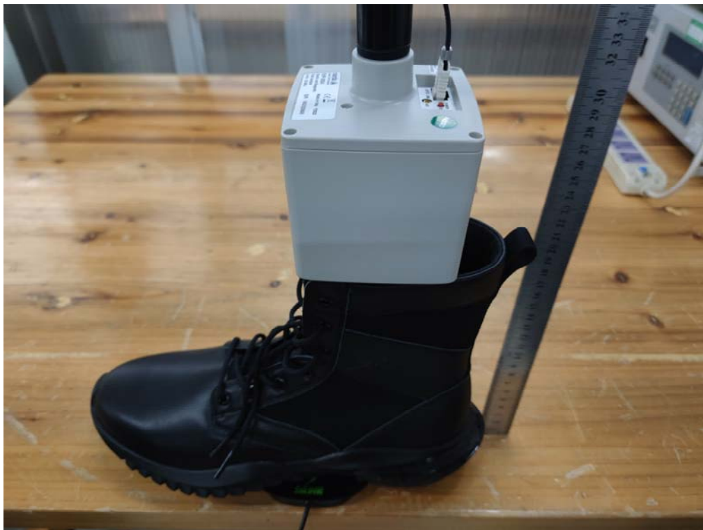
Test Position E-20cm from the edge of EUT to the geometric center of the probe