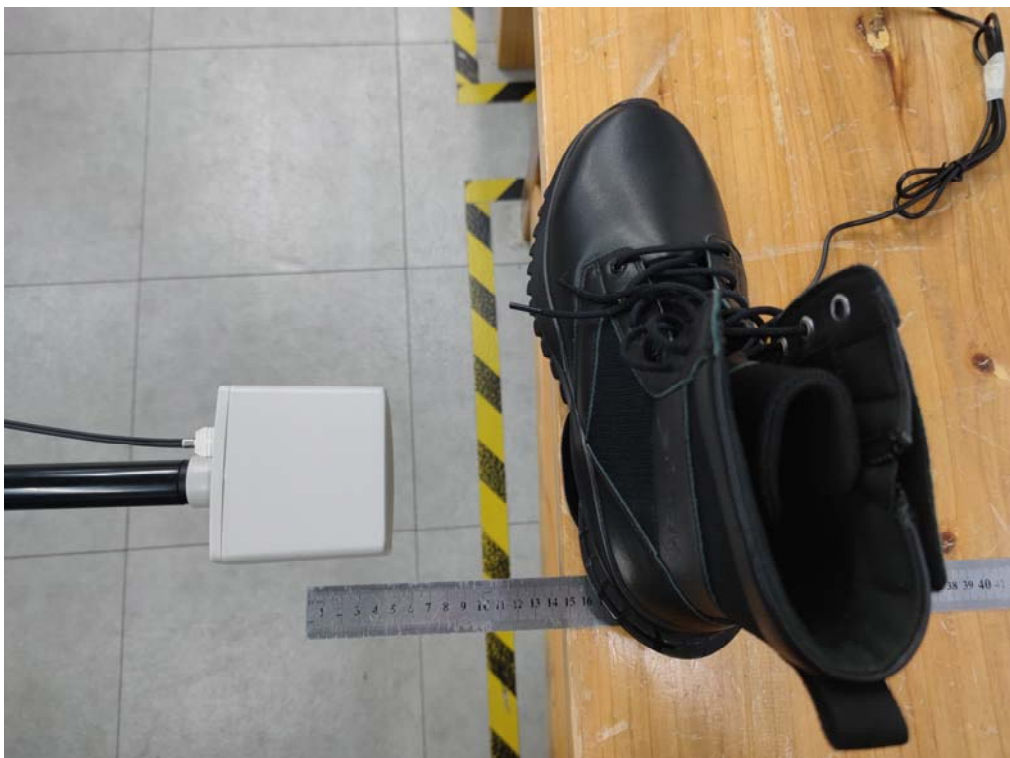
Test Position D-15cm from the edge of EUT to the geometric center of the probe