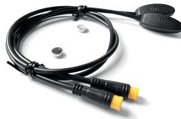
Magnetic Brake Sensors (optional)