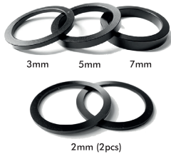
Bottom Bracket Spacers (3, 5 & 7mm for BSA version; 2mm (2pcs) for BB92 version)