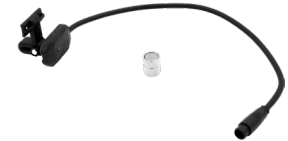
Magnetic Bluetooth Speed Sensor