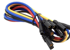
Controller Extension Wires (optional)