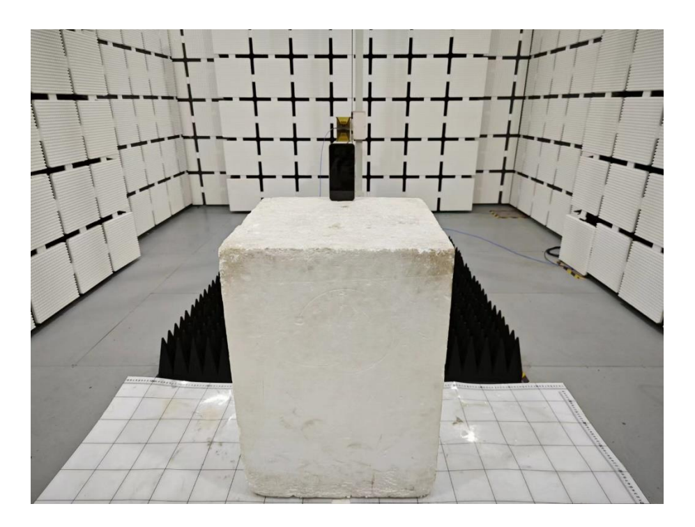
Set-up for Radiated Spurious Emission, Above 1GHz

Set-up for Transmitter & Receiver Spurious Emissions, 30MHz to 1000MHz