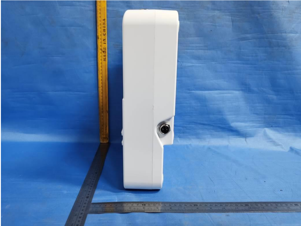
PORT VIEW OF EUT