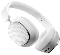
M12 Operating Manual