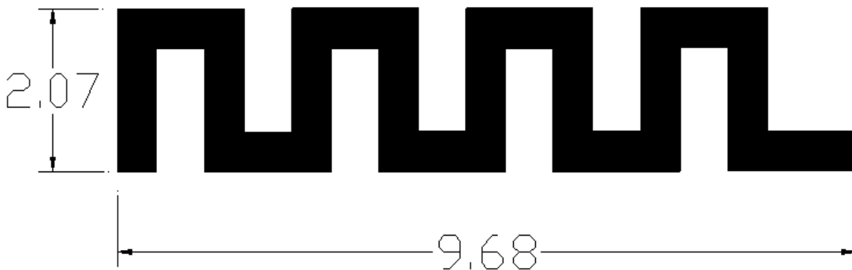
Antenna Photo & Length(mm)