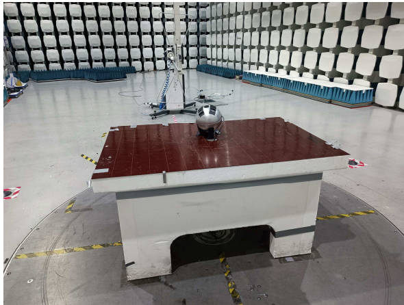
Radiated Emissions 30 – 1000 MHz