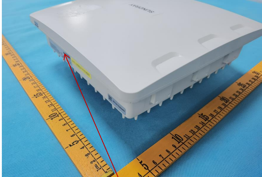
Label place Size:54*20mm