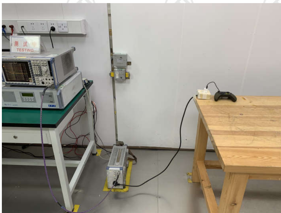
AC Power Line Conducted Emission