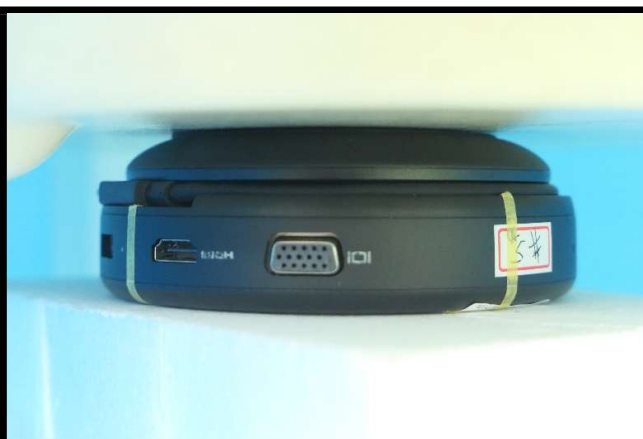
Rear Face of EUT Tested at 0 mm