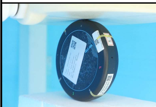
Two o'clock of the Right Curve of EUT Tested at 0 mm