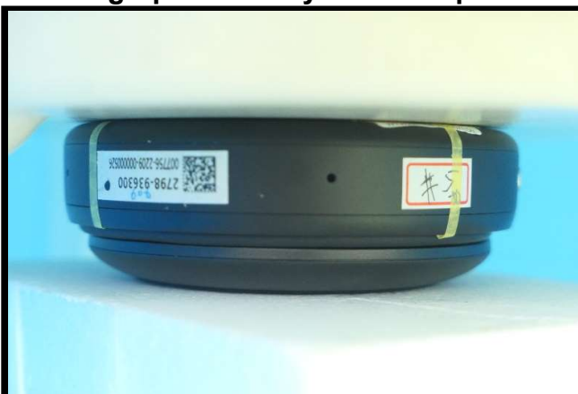
Front Face of EUT Tested at 0 mm