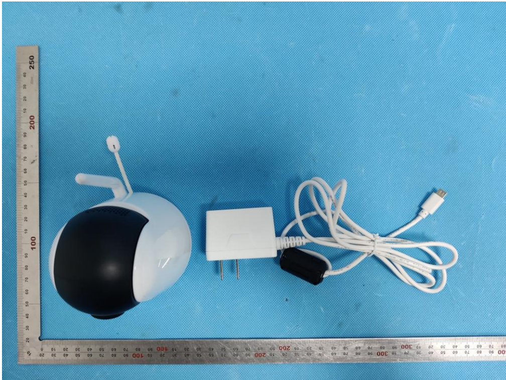
ADAPTER VIEW OF EUT