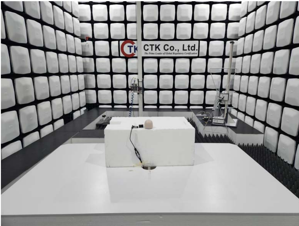
18 GHz to 26.5 GHz