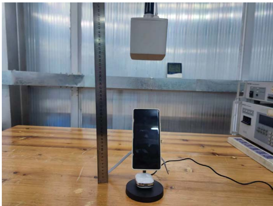
Test Position E-20cm from the edge of EUT to the geometric center of the probe