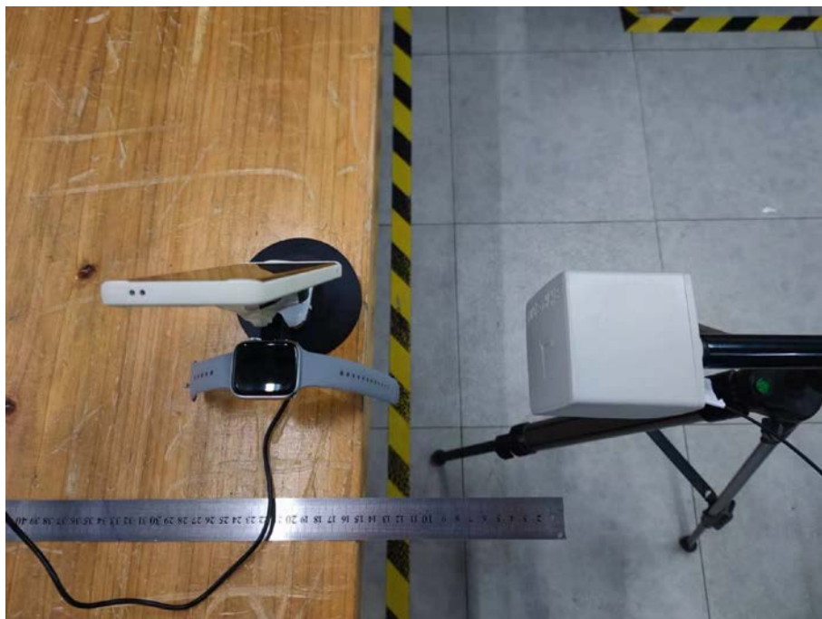
Test Position B-15cm from the edge of EUT to the geometric center of the probe