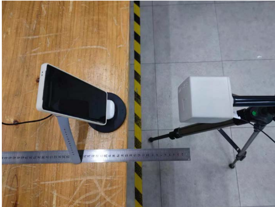
Test Position A-15cm from the edge of EUT to the geometric center of the probe