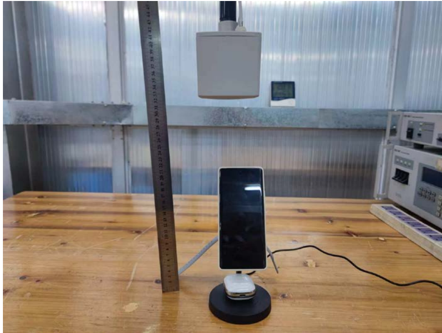
Test Position E-15cm from the edge of EUT to the geometric center of the probe