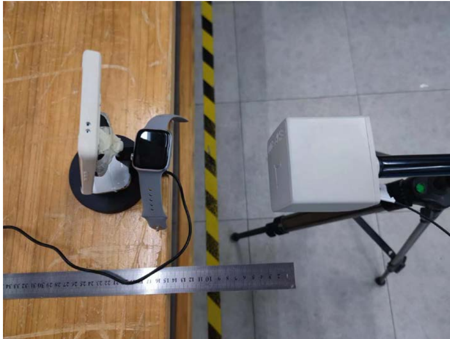
Test Position C-15cm from the edge of EUT to the geometric center of the probe