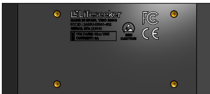
Figure 2. Final FCC Label on the product

The following image shows a drawing of the final Label, including the FCC Logo and FCC ID on the product: