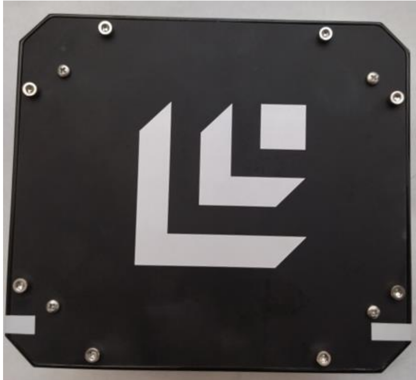
Figure 10. Left side view