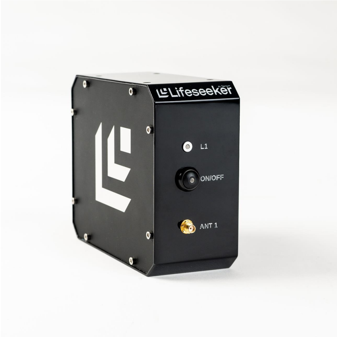
Figure 7: Front View. LED, On/Off button and RF connector for Antenna 1