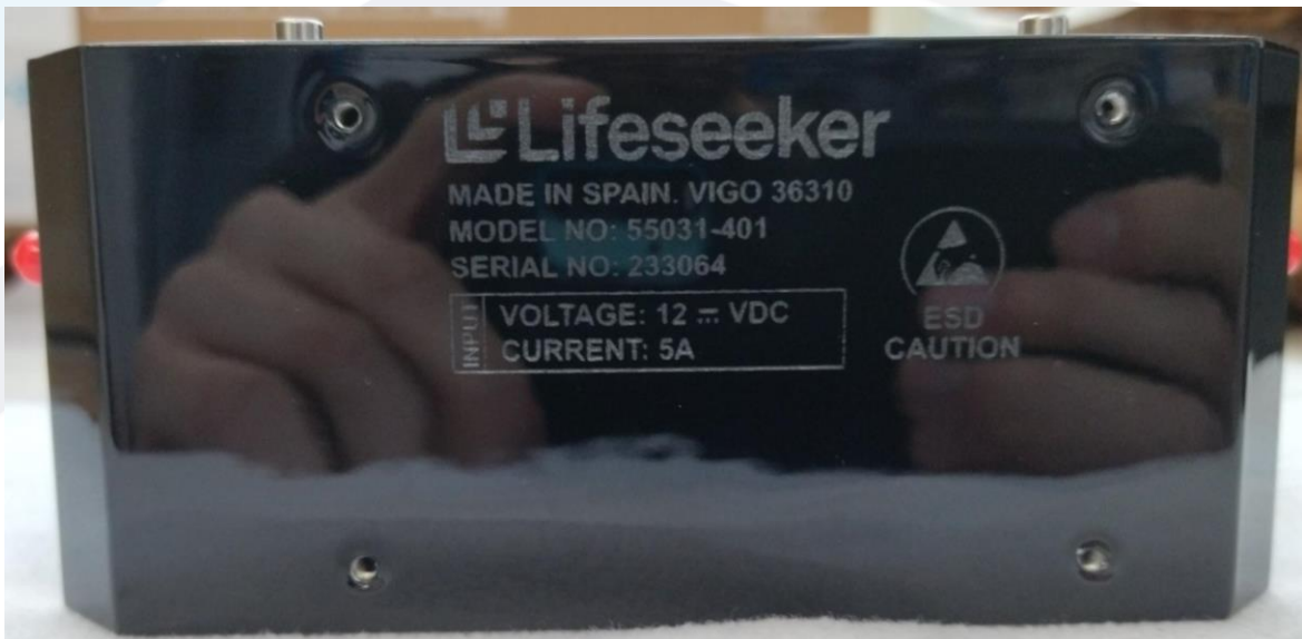
Figure 1. Bottom part of the product

The label in the Product Lifeseeker Mini S10 is located on the bottom part of the chassis, as shown in the following picture: