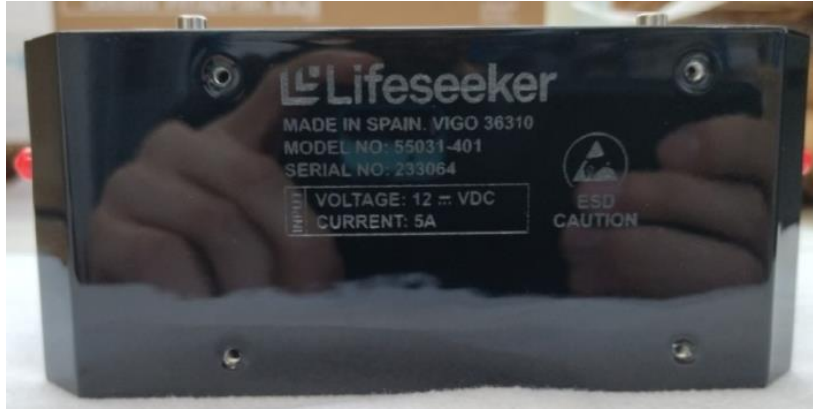
Figure 12. Bottom side view