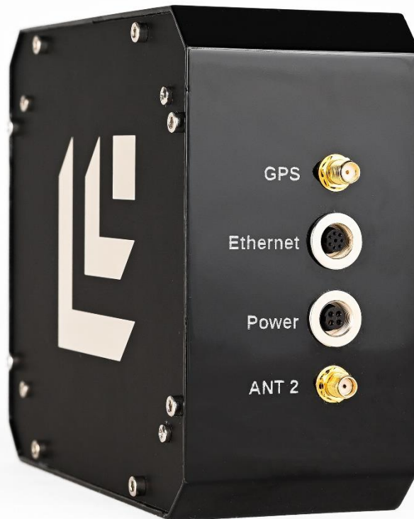
Figure 8. Back view. GPS, Power, Ethernet and RF Antenna 2 connectors