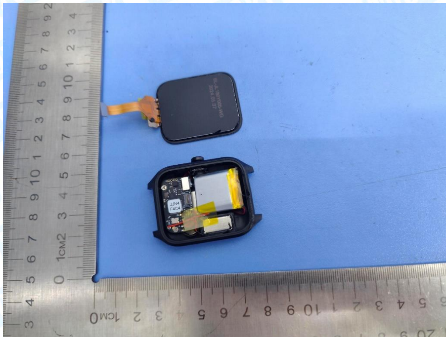
Photo 8 Appearance of PCB