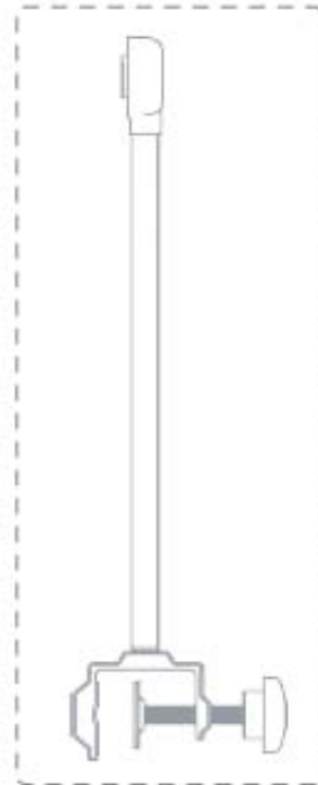
Crib holder x1