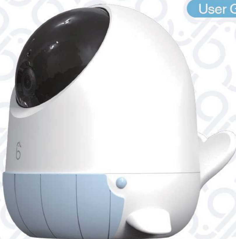
Simshine baby 2