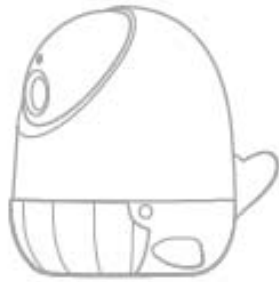
Simshine baby 2 x1