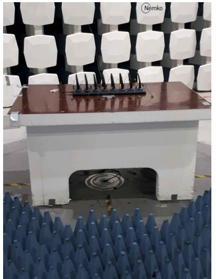
Radiated emission above 1 GHz