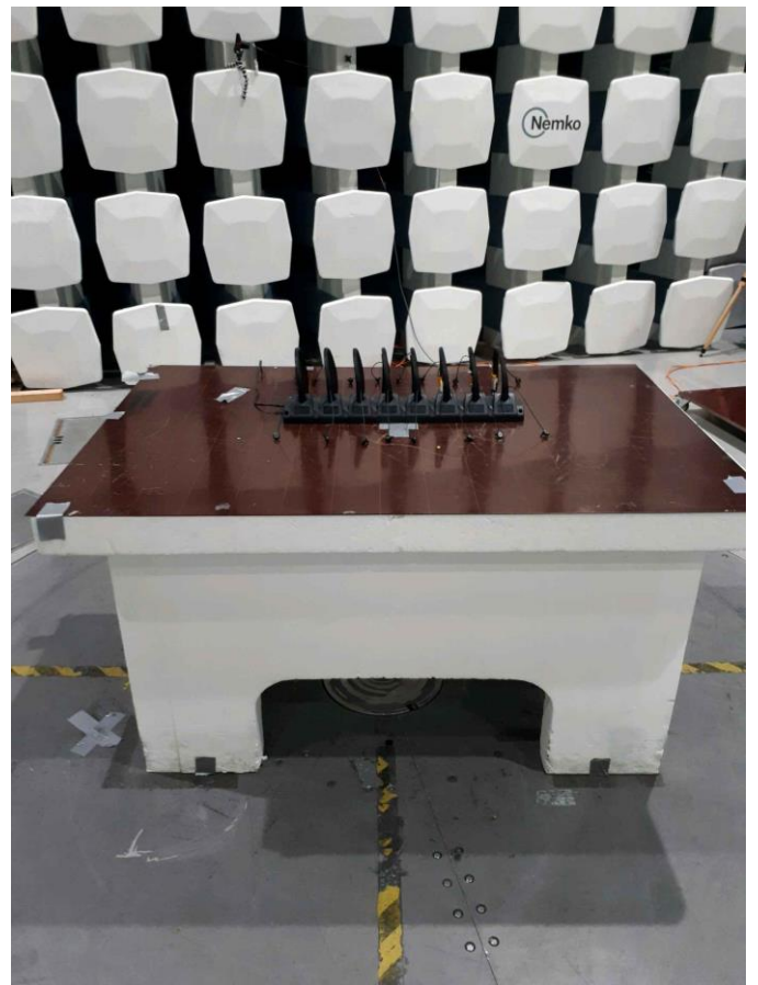
Radiated emissions below 1 GHz