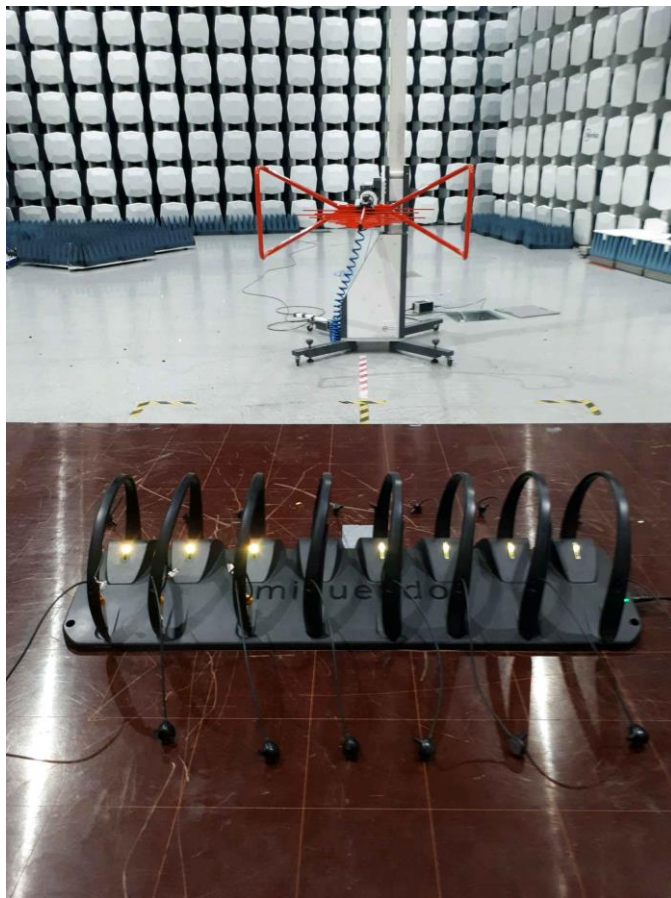
Radiated emissions below 1 GHz FCC