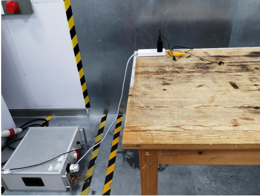
Emissions in frequency bands (below 1GHz)