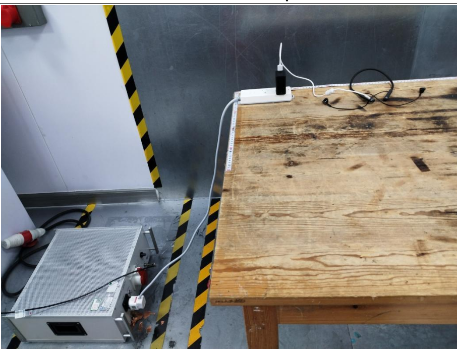
Emissions in frequency bands (below 1GHz)