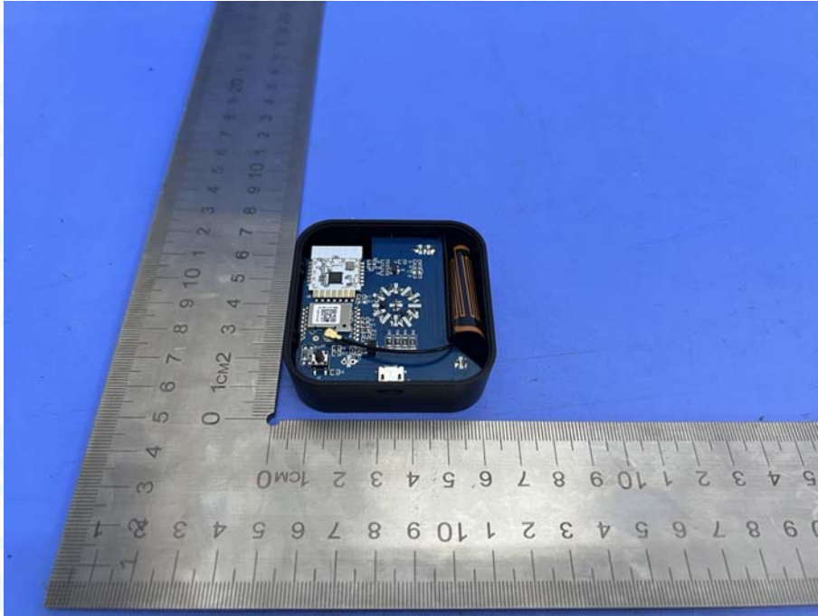
Photo 7 Internal of PCB