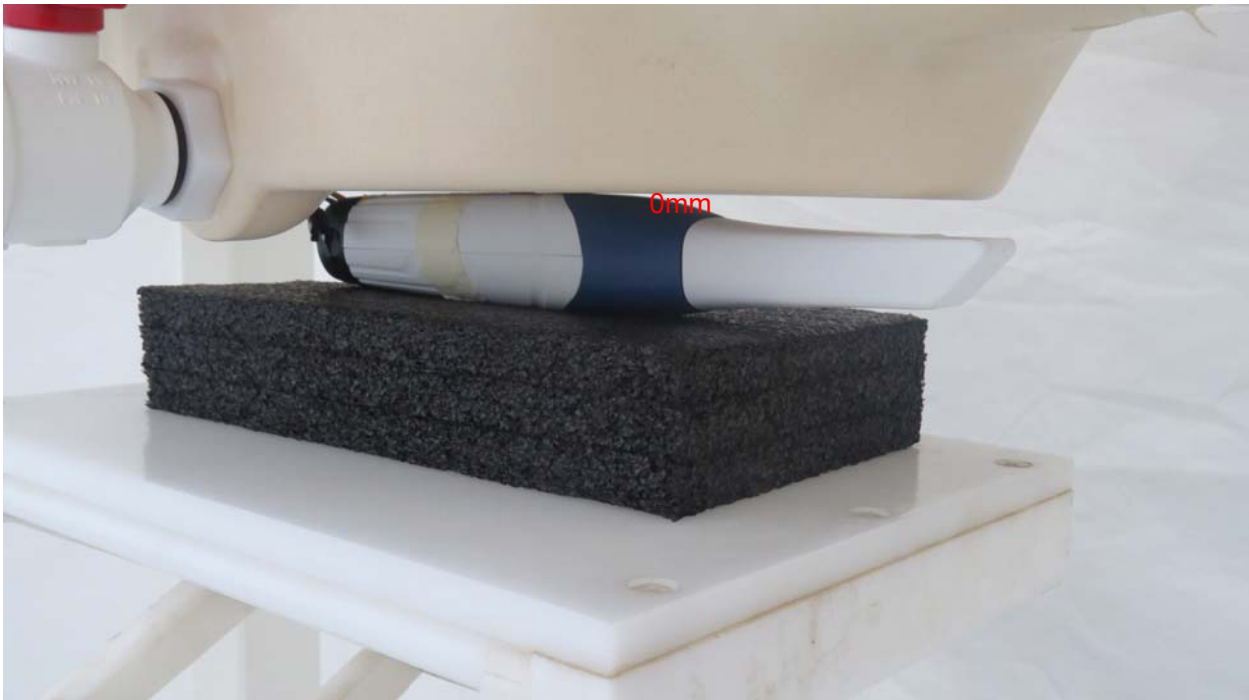
Picture 2: Front Side, the distance from handset to the bottom of the Phantom is 0mm