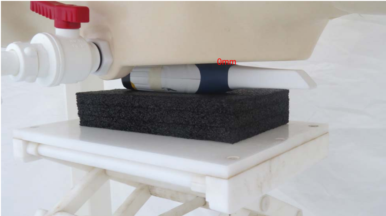
Picture 1: Back Side, the distance from handset to the bottom of the Phantom is 0mm