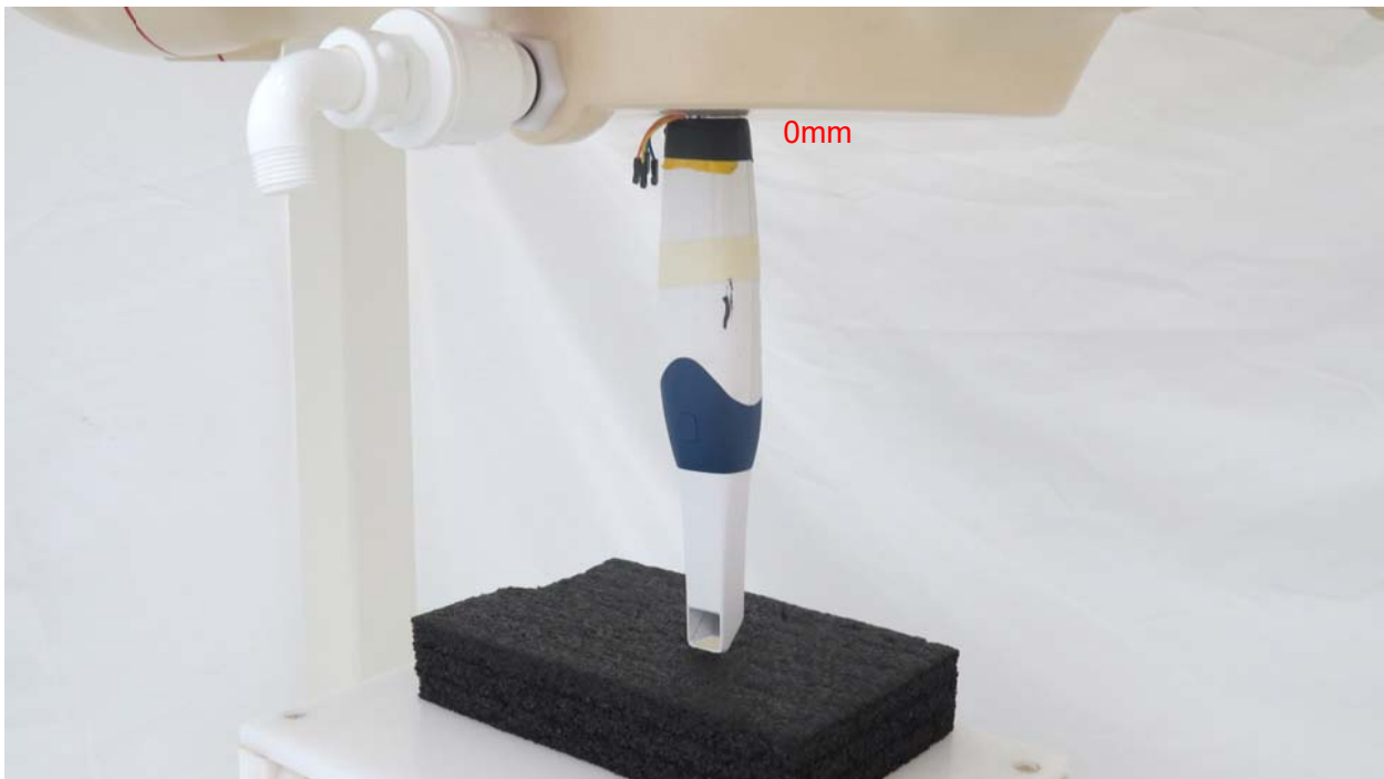
Picture 6: Bottom Edge, the distance from handset to the bottom of the Phantom is 0mm