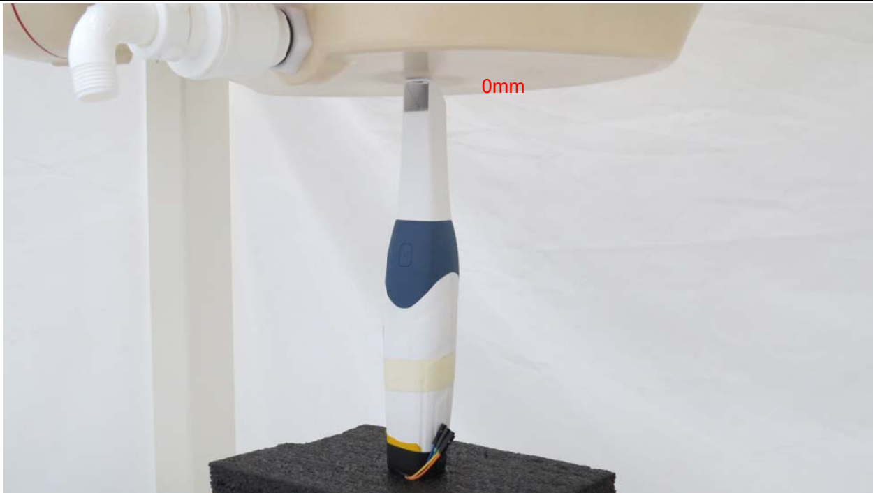
Picture 5: Top Edge, the distance from handset to the bottom of the Phantom is 0mm