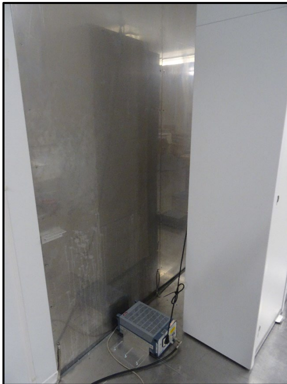
Photo 7 AC Conducted Test Setup