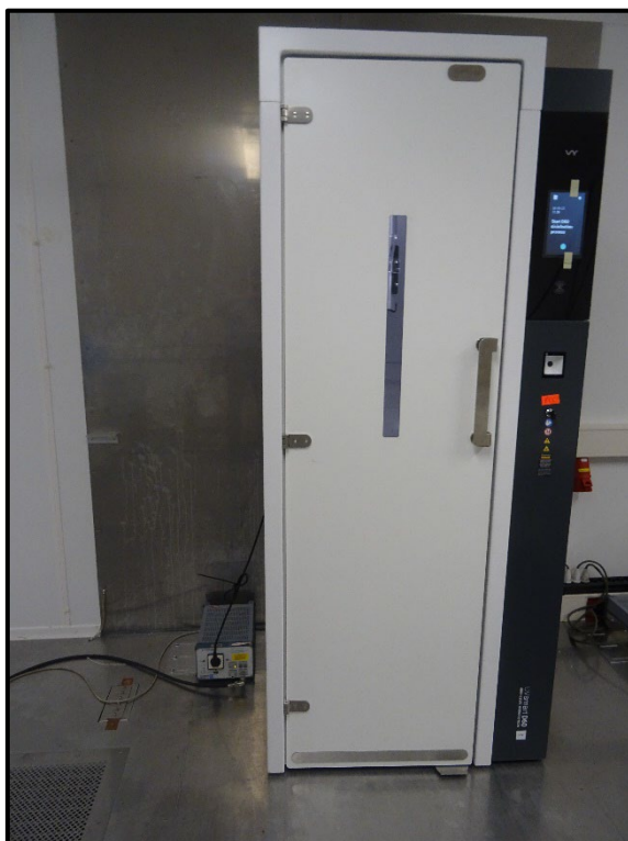
Photo 8 AC Conducted Test Setup