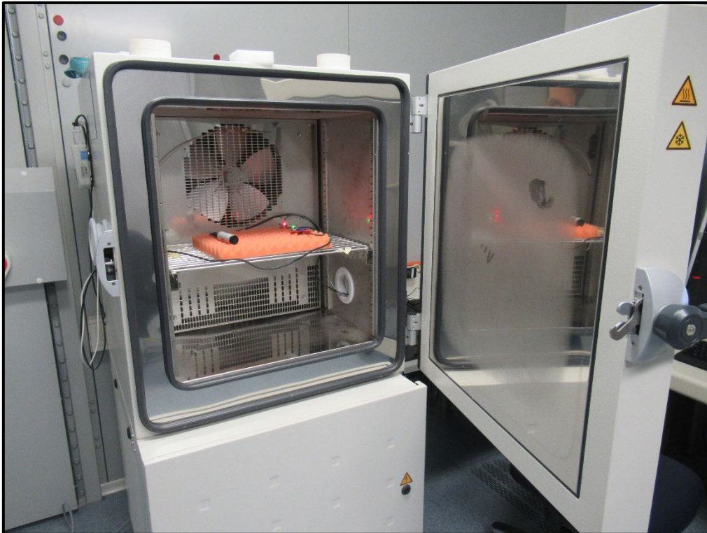
Photo 5 Test Setup - Frequency Stability (Temperature & Voltage Variation)