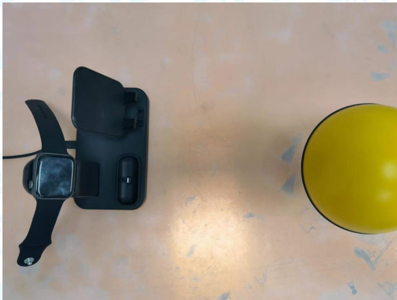
Test Set-up Photo