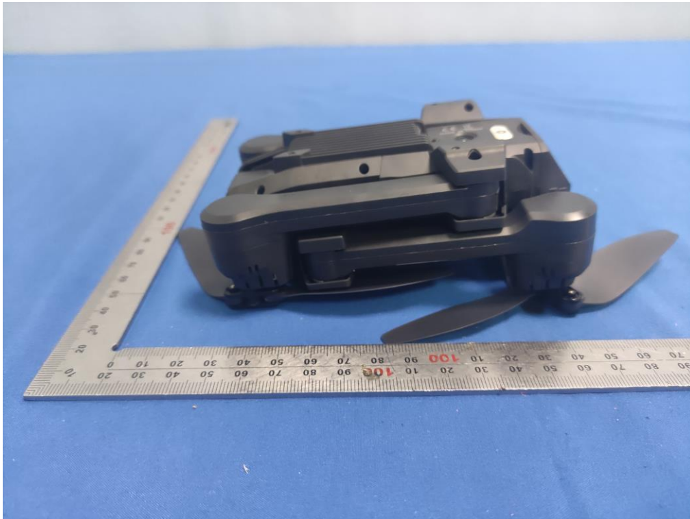
EXTERNAL VIEW-7 OF EUT