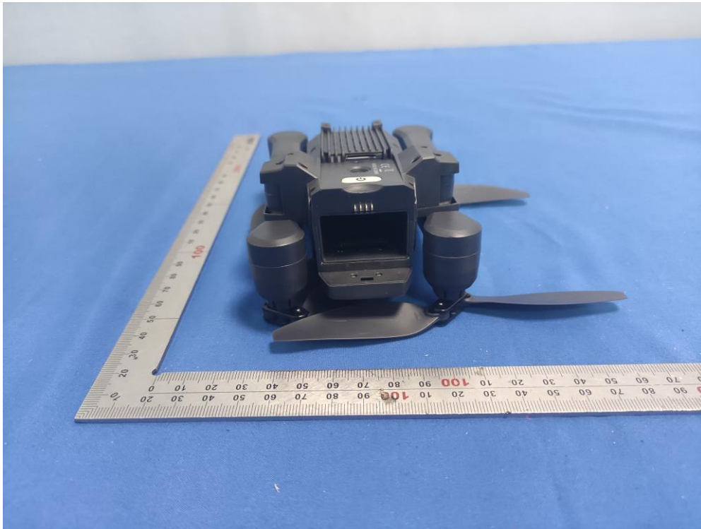
EXTERNAL VIEW-5 OF EUT