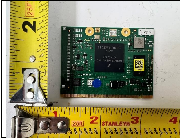
EUT Top View