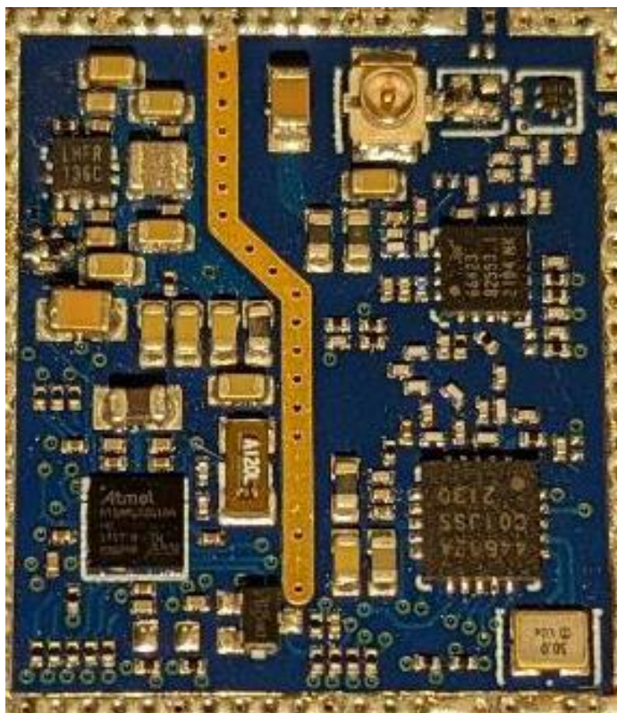
Photograph 3 – Close up of RF circuitry