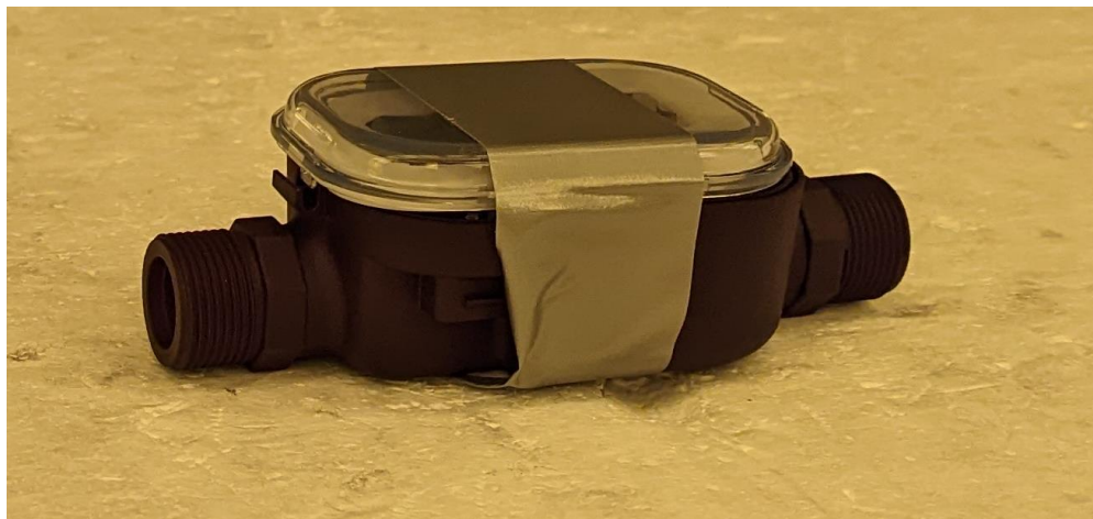
Photograph 5 – Side View of EUT