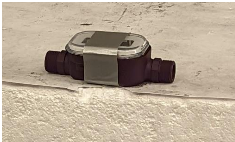
Photograph 6 – Side View of EUT