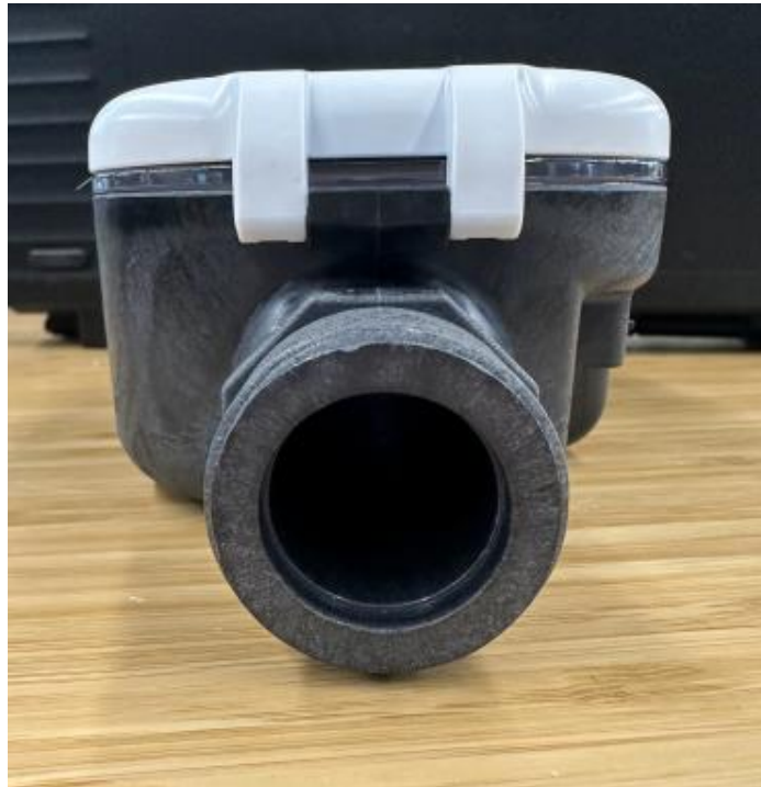
Photograph 8– Left End View of EUT