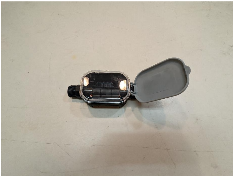
Photograph 2 – Front View of the EUT, Cover Open