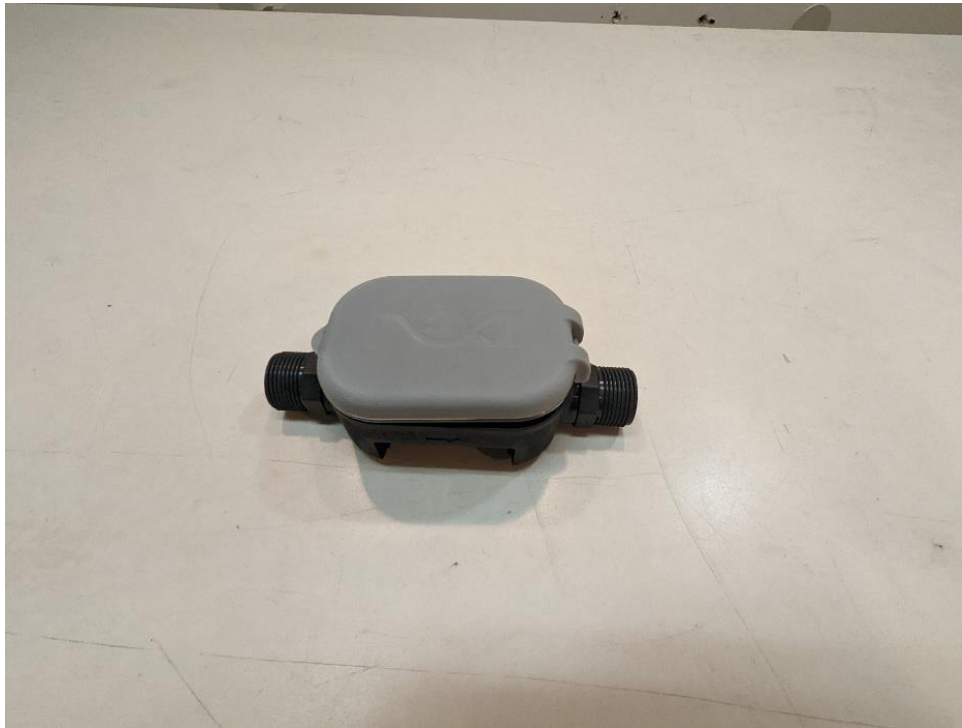
Photograph 1 – Front View of the EUT, Cover Closed