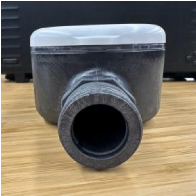
Photograph 7 – Right End View of EUT