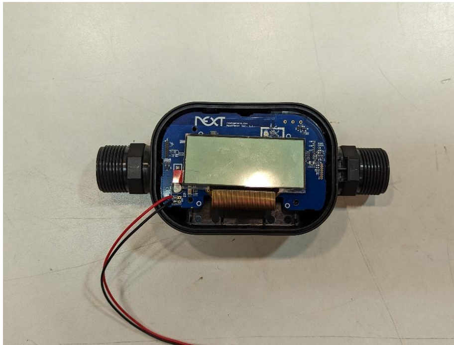
Photograph 3 – PCB Placement in EUT