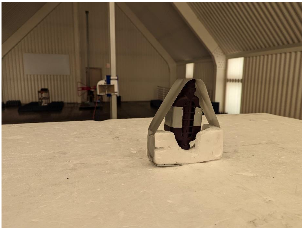
Photograph 4: EUT “Vertical” Orientation