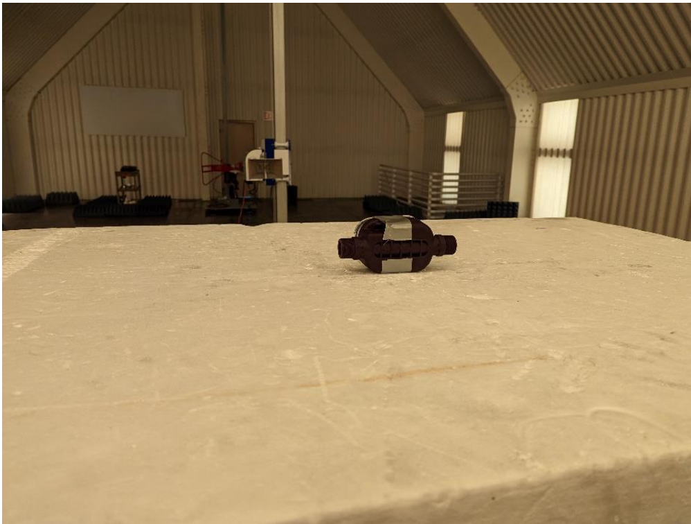
Photograph 6: EUT “On Edge” Orientation