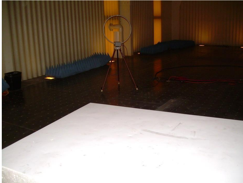
Photograph 7: Reference Photo of Test Setup for Emissions Below 30 MHz