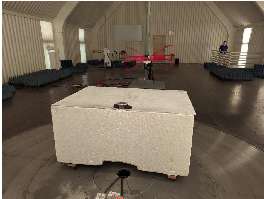
Photograph 2: Back View Radiated Emissions, Below 1000 MHz Worst Case Configuration