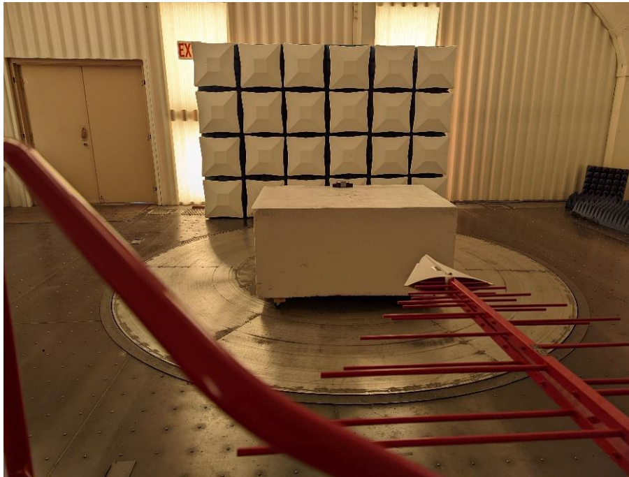
Photograph 1: Front View Radiated Emissions, Below 1000 MHz Worst Case Configuration