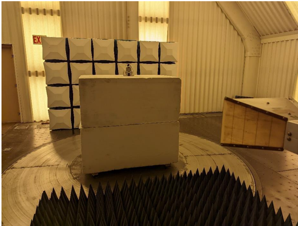
Photograph 3: Front View Radiated Emissions Worst Case – Above 1000 MHz Configuration