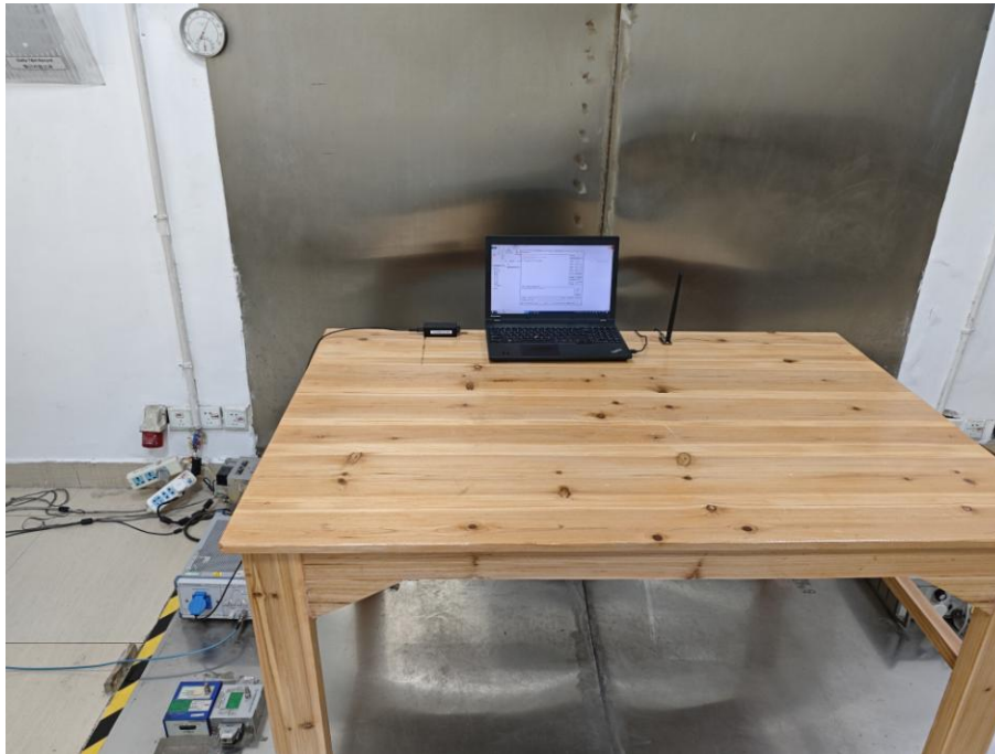
Conducted Emission Side View