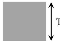
( Side View )