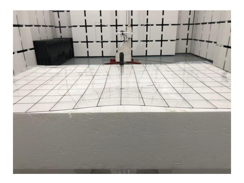
Radiated Spurious Emission Test Setup Photo - Above 1GHz

Radiated Spurious Emission Test Setup Photo - Below 1GHz