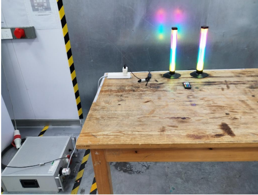
Emissions in frequency bands (below 1GHz)