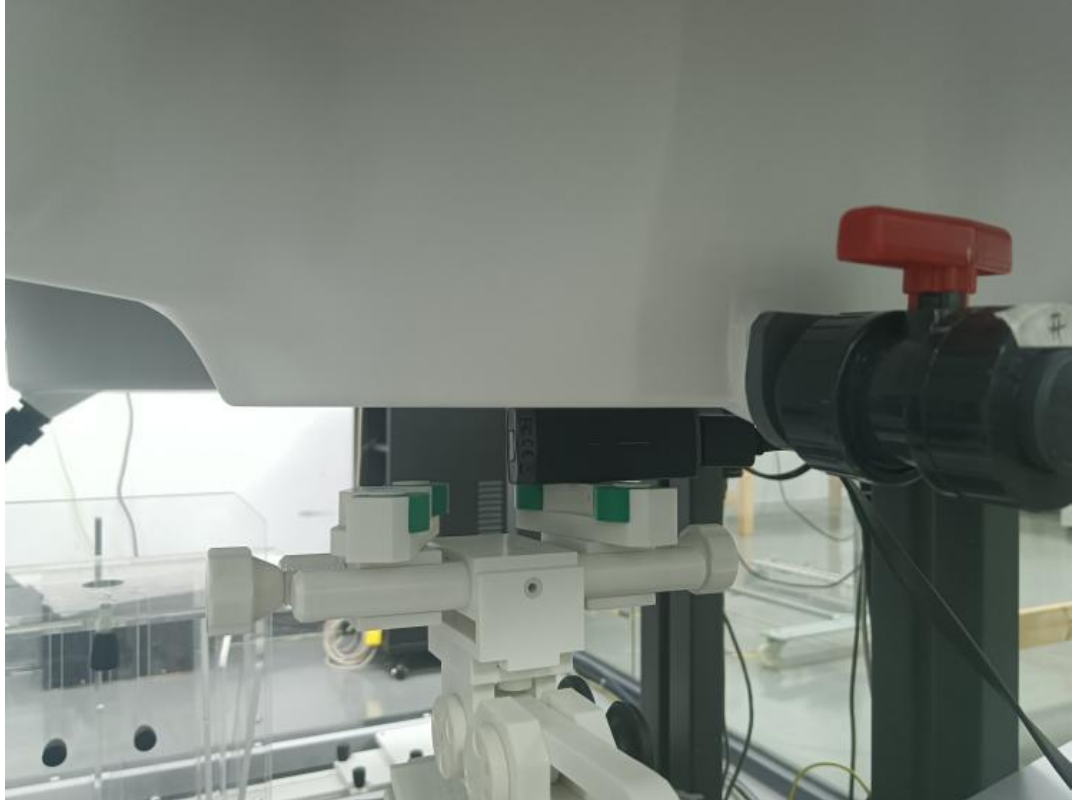
Left (dist. 0mm)