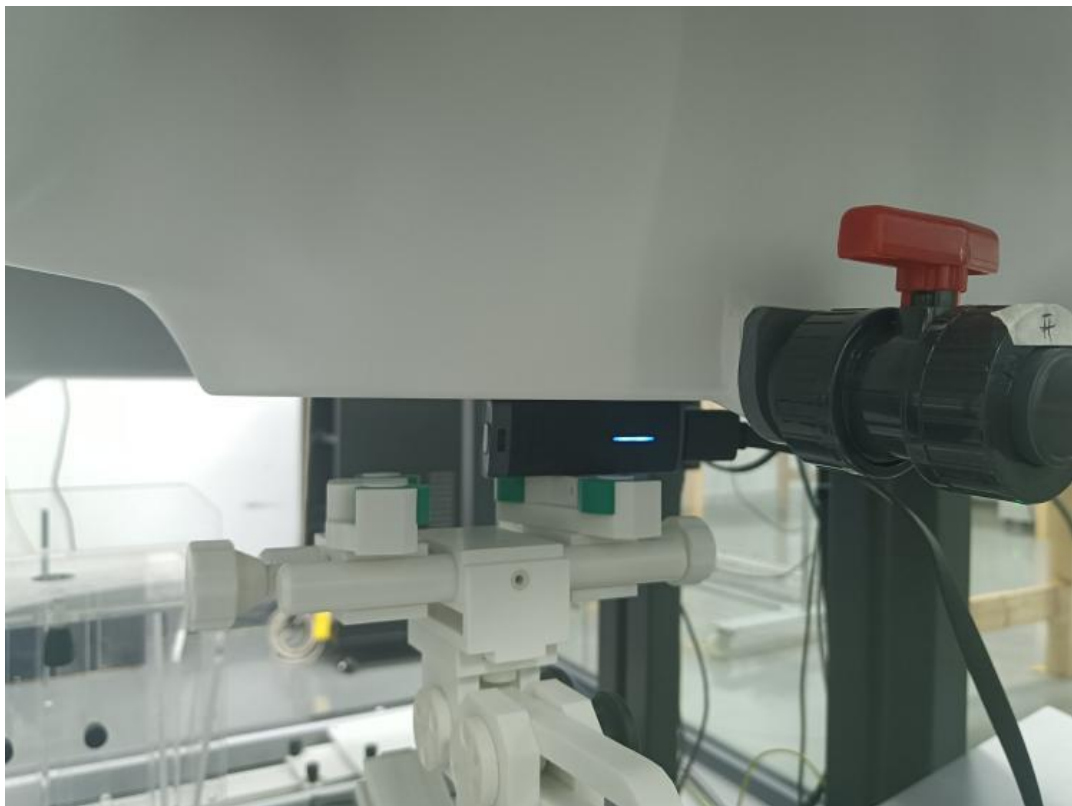
Right (dist. 0mm)