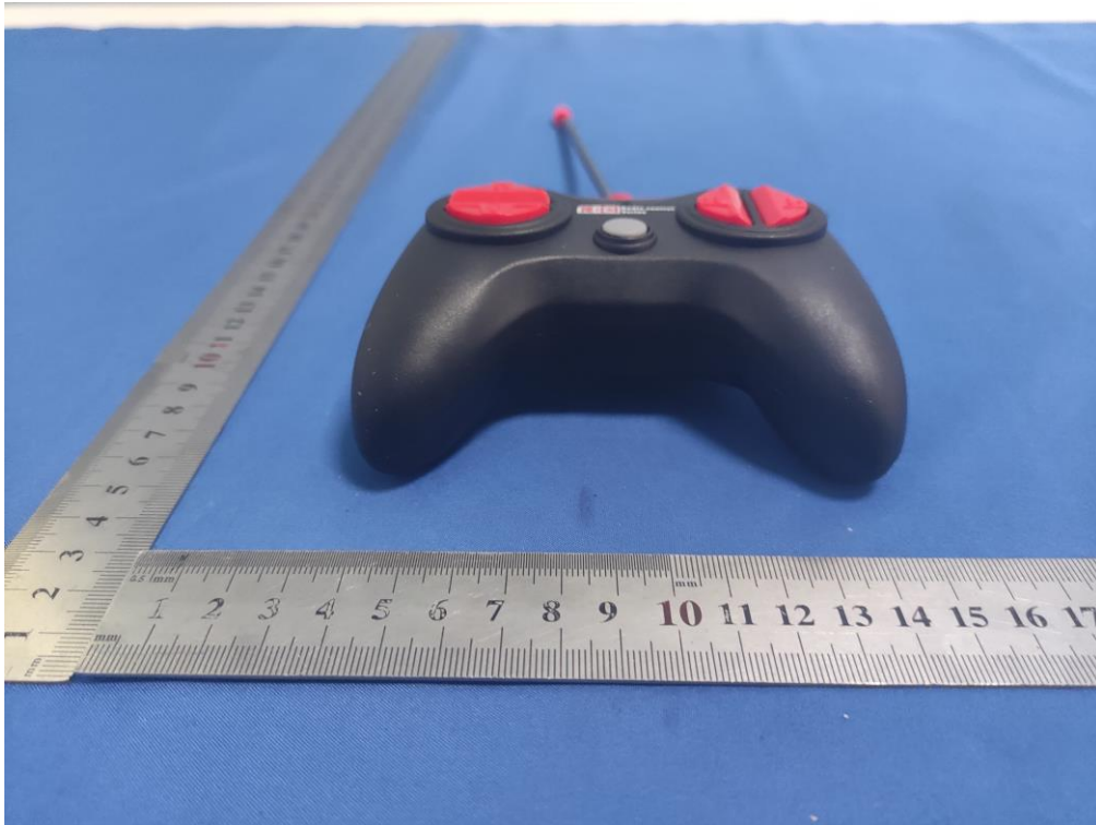
BACK VIEW OF EUT