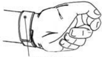
Position of Watch Wearing and Data Collector